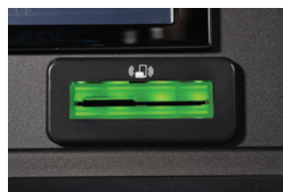
Green indicates active "carded"