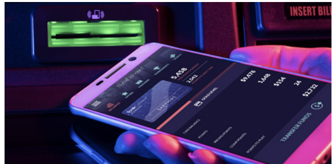
Near-field Communication (NFC) Without Card