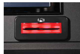
Red indicates misread/failed connection