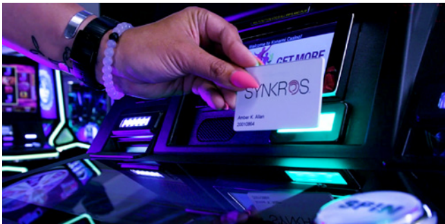
Near-field Communication (NFC) With Card

SYNKROS supports a mix of alternative player login options, beyond the swipe of a traditional player loyalty card. Players can enjoy contactless login with a simple tap near the card reader through any Near Field Communication (NFC) device, such as an NFC-enabled players card, fob, or mobile. SYNKROS also supports mobile login via QR code. Operators can also enable cardless login by phone number, which allows players to pull up their account simply by entering the corresponding phone number on-file for their account.