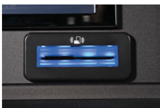
Blue indicates "uncarded"

Konami's RGB Card Reader features internally lit RGB functionality that emits changing light colors to signal the status of player login at a machine. The color changes to blue for an inactive/uncarded connection, green for a successful active connection, and red for a misread/failed connection. It can even combine with Near Field Communication (NFC) technology for contactless login authentication. This provides immediate visual communication to players and staff on login status.